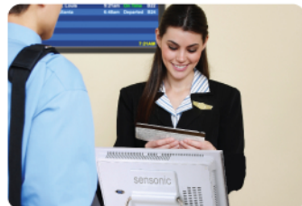
- Inquirer system in library or museum - Platform to your VIP in saloon, airport, bank etc