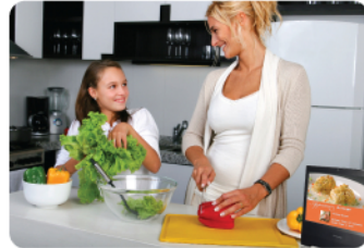
Kids are hungry, what can you do as a busy housewife like you? Browse online for recipe. Follow the cooking steps.