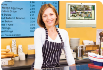
CCTV Surveillance Display Terminal/Command Station Home Automation-Control Device