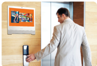
Digital Display: Advertising-Information Center